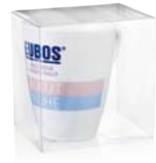
PET-Box Art.-No.: 54736