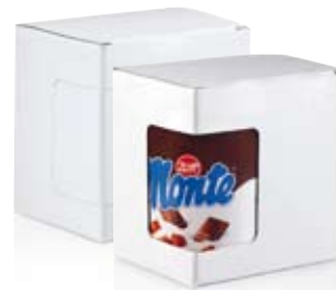
white plain, incl. perforated window Art.-No.: 54839