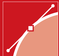
Vector data (preferred)