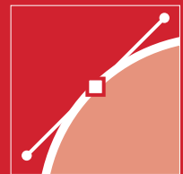
Vector data (preferred)